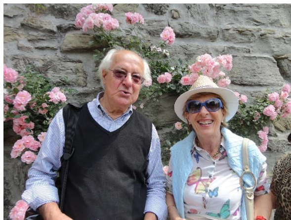
Behind us 'Rosario' rose